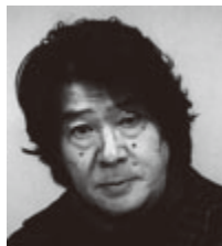
Photographer Daido Moriyama

Sales・Planning Plexus Co., Ltd. Date of foundation : November, 2011 Capital : 3,000,000 Yen Location : Mercury Square 6F, 4-33-2 Yotsuya, Shinjuku-ku, TOKYO 160-0004 TEL +81-3-5368-0511 / FAX +81-3-5368-0510