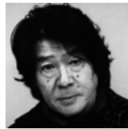
Photographer Daido Moriyama