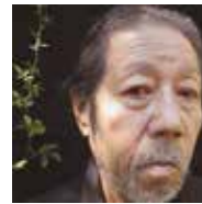
Photographer Issei Suda