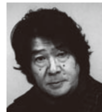
Photographer Daido Moriyama