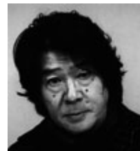
Photographer Daido Moriyama